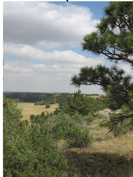
One of the stops on the October 22 tour