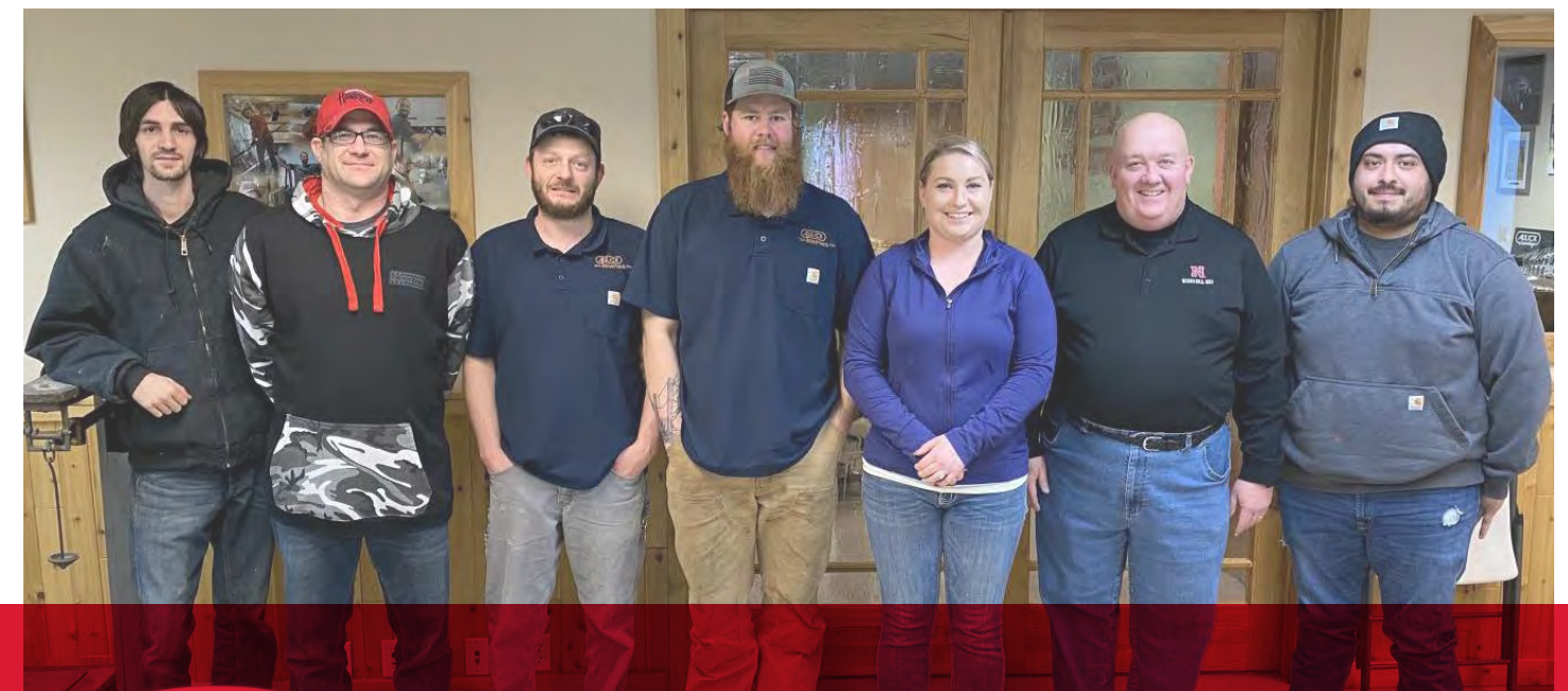
The Nebraska Manufacturing Extension Partnership offers training, certification and consulting services relating to strategy, workforce, sustainability and compliance, marketing and more to Nebraska's manufacturers.