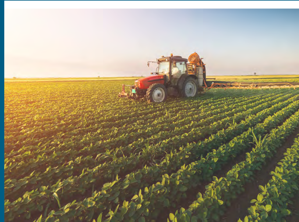
Even during years when commodity prices are relatively low, producers still hire workers, buy and repair equipment and make other business decisions that keep most aspects of Nebraska's agricultural production complex strong.