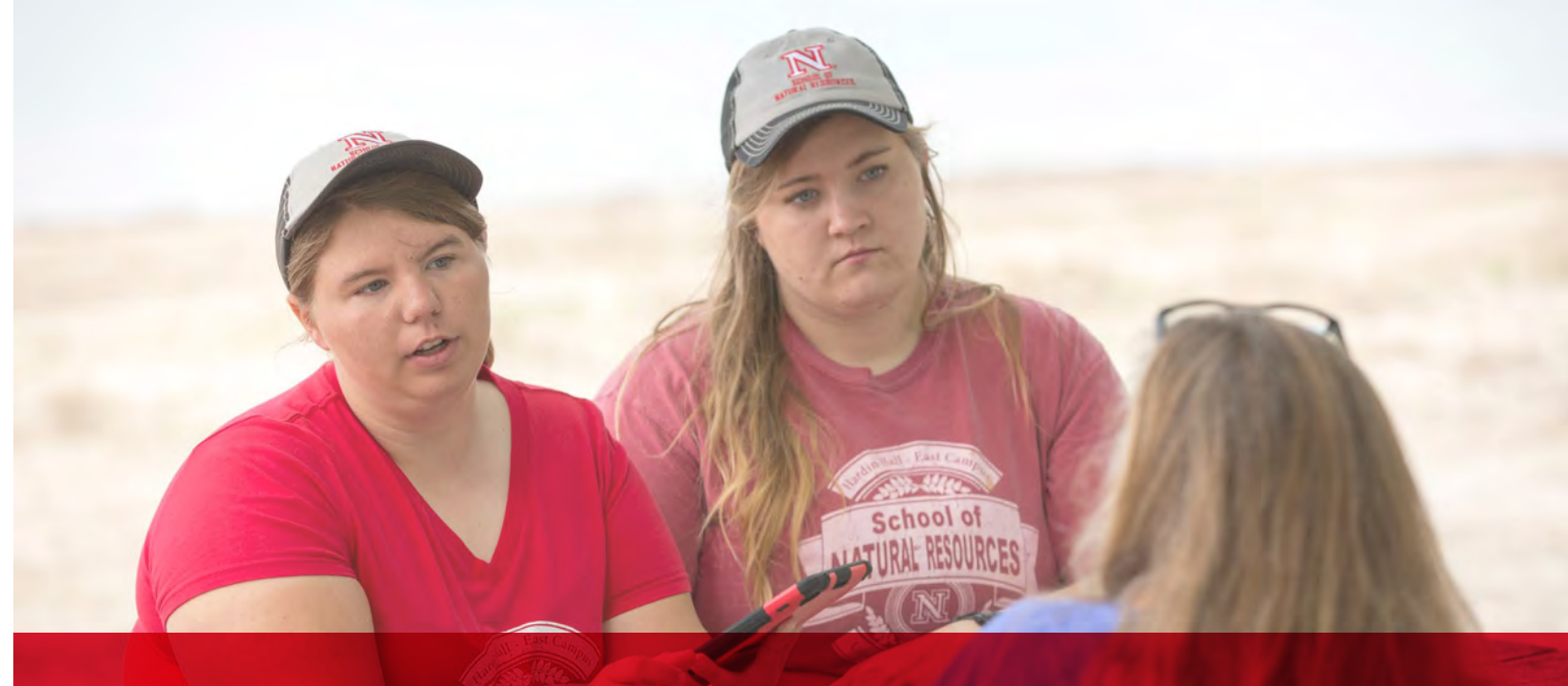
For the past decade, UNL researchers have conducted surveys of anglers at 24 Nebraska water bodies. Survey findings are being used to guide everything from management decisions to local marketing efforts.