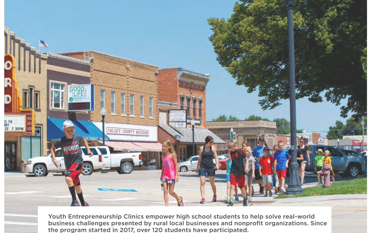
Youth Entrepreneurship Clinics empower high school students to help solve real-world business challenges presented by rural local businesses and nonprofit organizations. Since the program started in 2017, over 120 students have participated.