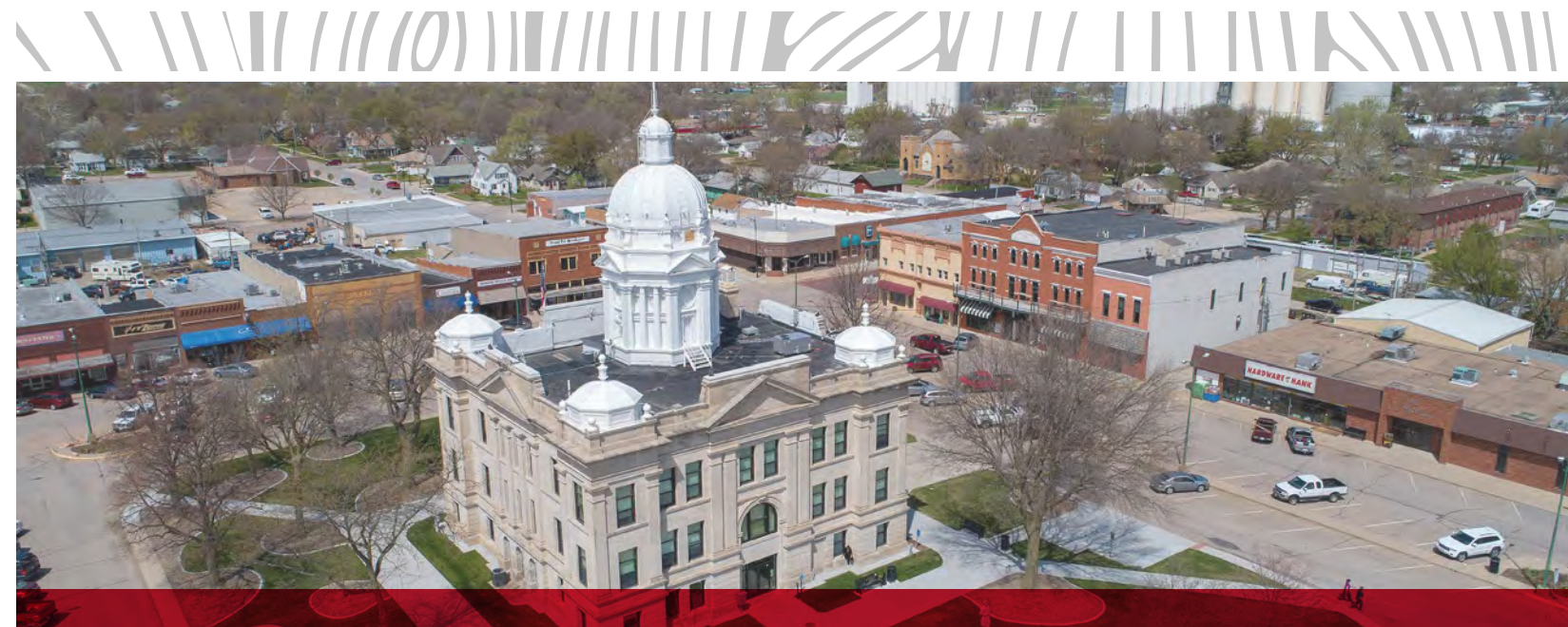
Launched in 2020, Rural Prosperity Nebraska brings together the Rural Futures Institute and Nebraska Extension's Community Vitality Initiative to help the state's rural communities thrive.

Learn more at: ruralprosperityne.unl.edu .